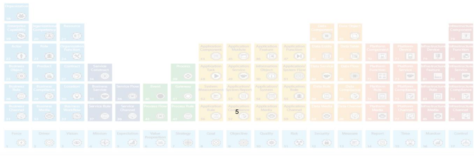
Table 2: Objects typically associated with Cost linked to Business Processes.