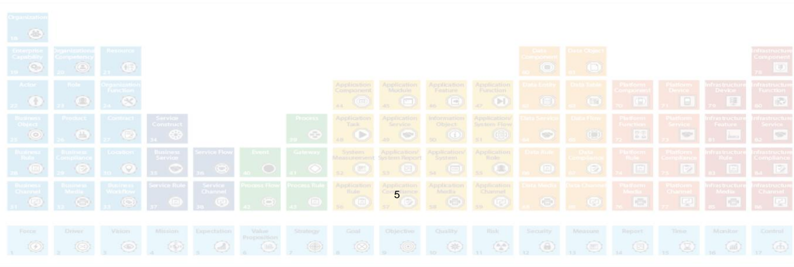
Table 2: Objects typically associated with the Balanced Scorecard linked to Performance Expectations.