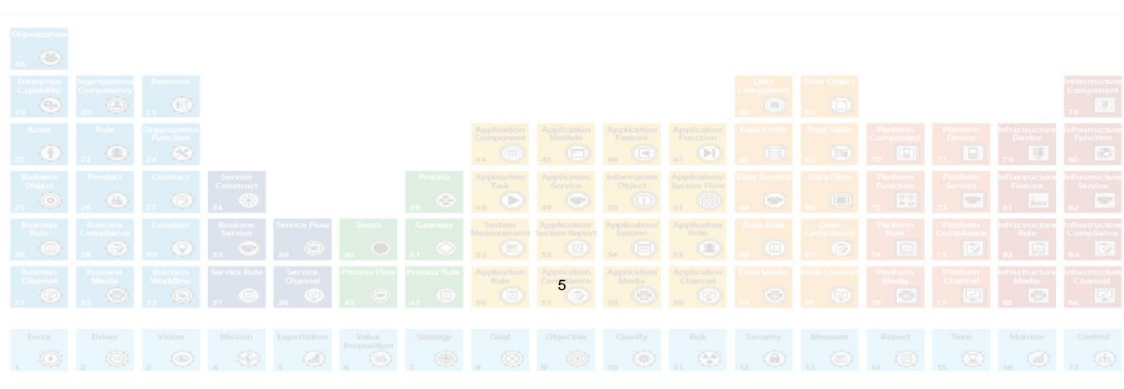
Table 2: Objects typically associated with the Measurement & Reporting linked to Contracts.