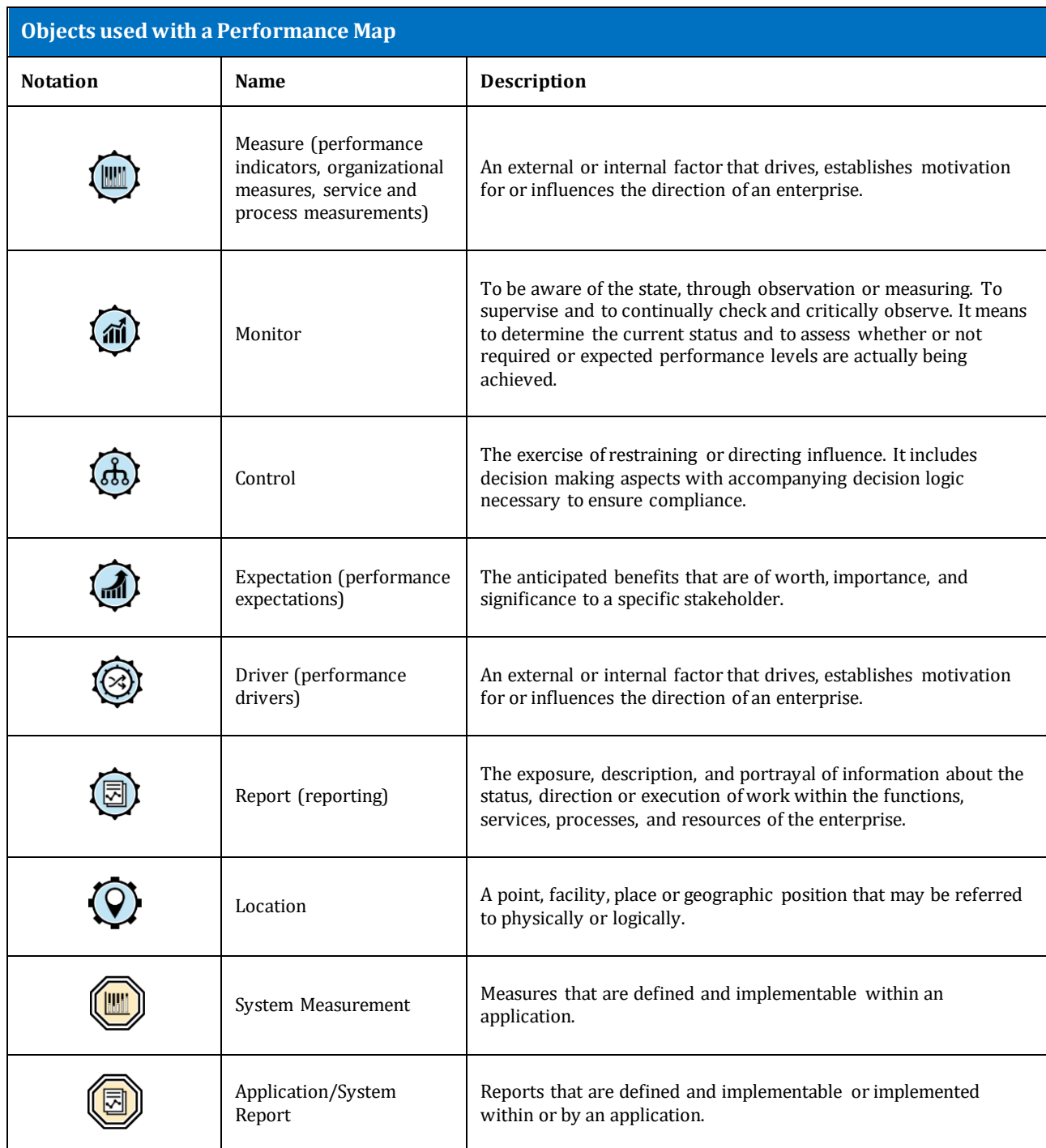
Table 2: Objects typically associated with a Performance Map.

The objects involved with a Performance Map is shown in Table 2.