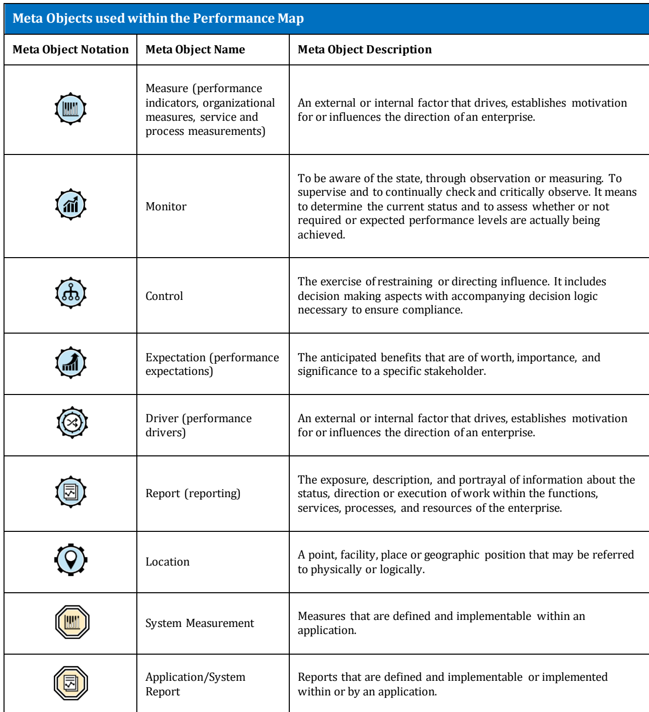
Table 2: Meta objects typically associated with the Performance Map.

The meta objects involved with a Performance Map is shown in Table 2.