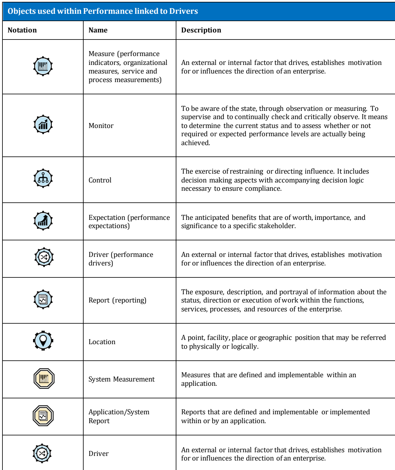
Table 2: Objects typically associated with Performance linked to Drivers.

The objects involved with Performance linked to Drivers is shown in table 2.