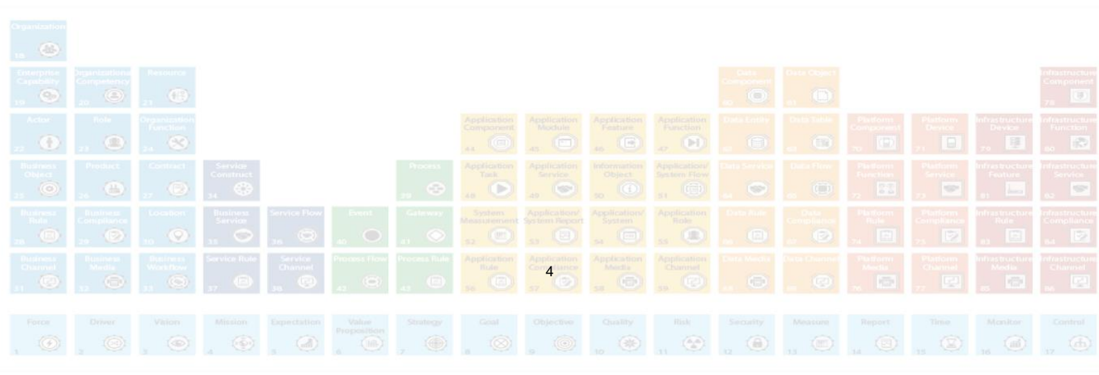
Table 2: Objects typically associated with the Vision Map.