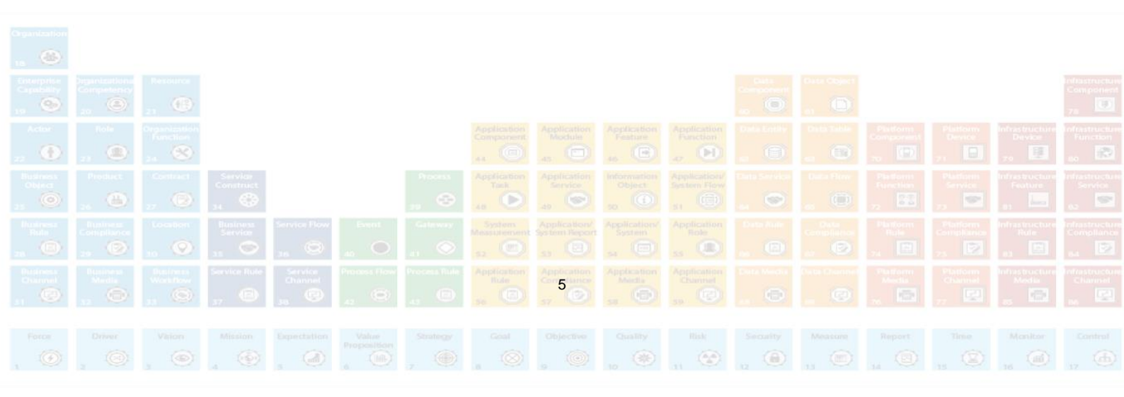
Table 2: Objects typically associated with Cost linked to Process Activities.