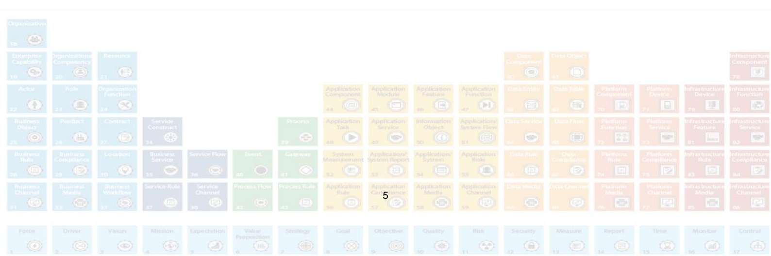
Table 2: Objects typically associated with the Measurement & Reporting linked to Plans.