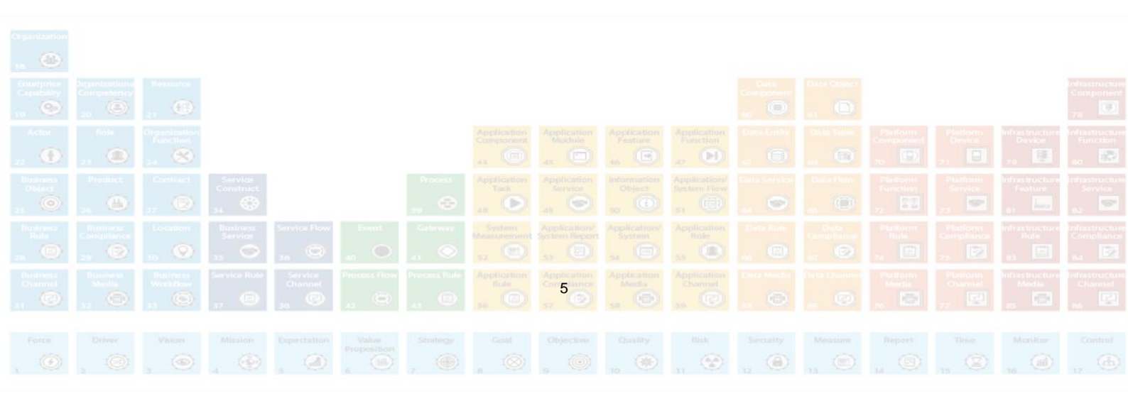
Table 2: Objects typically associated with the Balanced Scorecard linked to Requirements.

The objects involved with a Balanced Scorecard linked to Requirements is shown in Table 2.