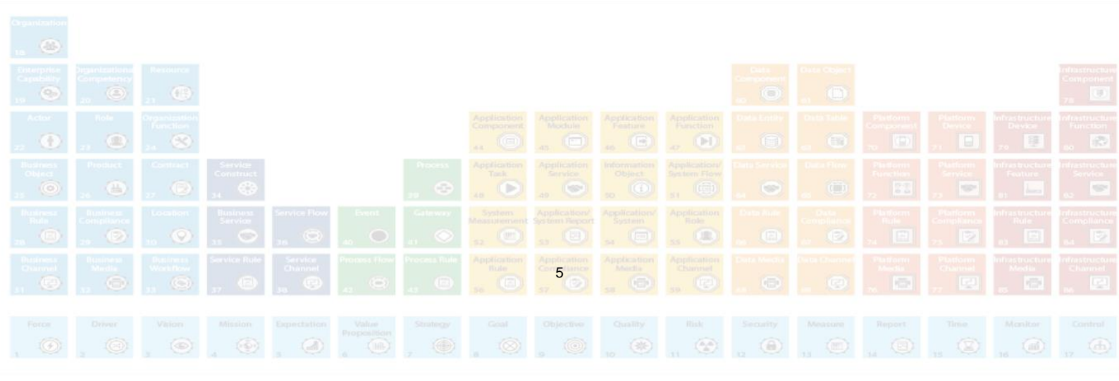
Table 2: Objects typically associated with the Balanced Scorecard linked to Measurements.

The objects involved with a Balanced Scorecard linked to Measurements is shown in Table 2.