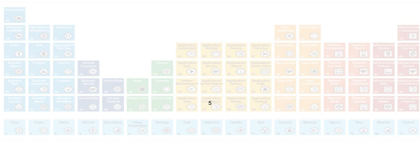
Table 2: Objects typically associated with the Balanced Scorecard linked to Reporting.